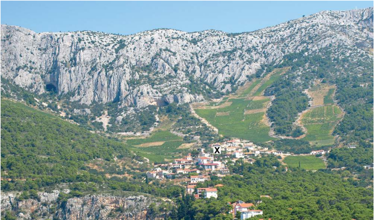
Fig. 2.1 for Question 2